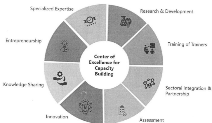
Figure I: Features of Centre of Excellence (CoE)